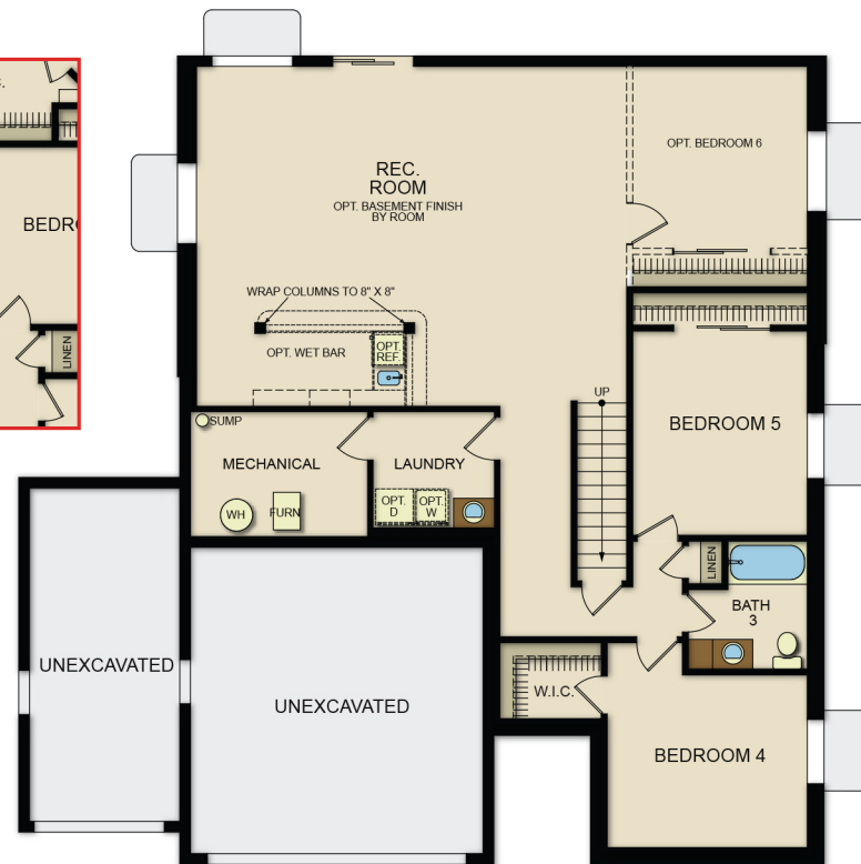
OPTIONAL BASEMENT | LAYOUT 2 - UNFINISHED ADDS 1,585 SQ FT - FINISHED ADDS 1,406 SQ FT