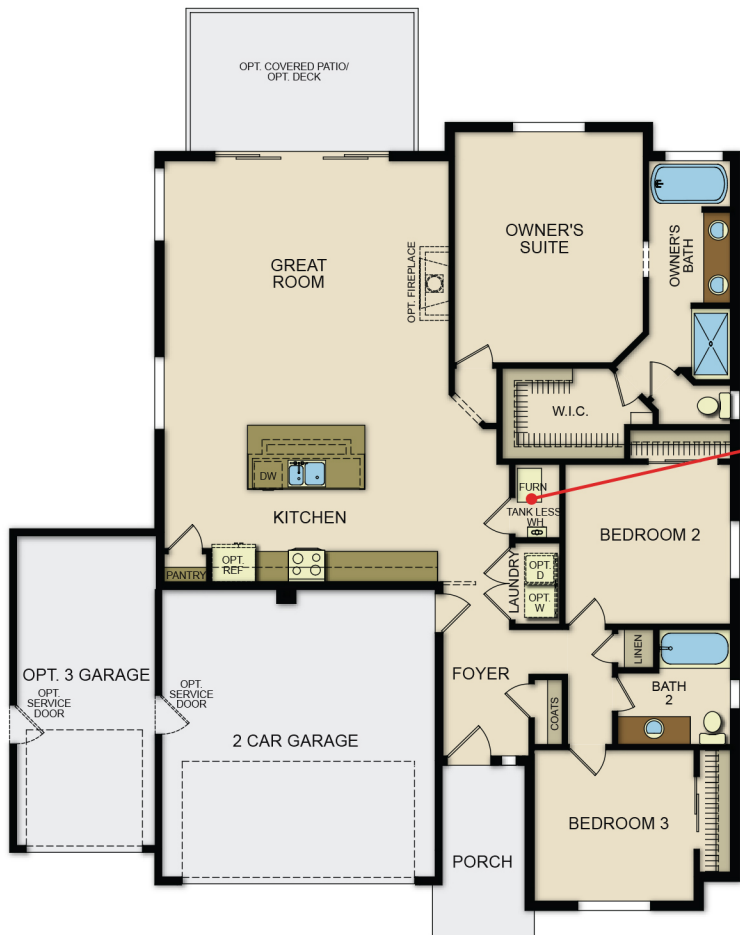
FIRST FLOOR | LAYOUT 1 1,617 SQ FT